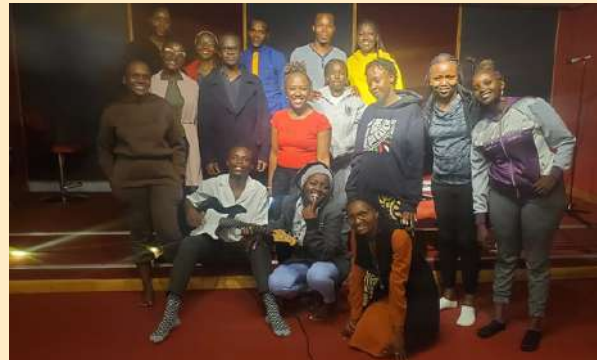
A pose after kujibamba ndani ya Yesu