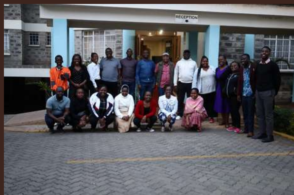
Click ya youth Summit

One thing was clear without our members we would not have come thus far indeed walijipa na form ikajipa. Book some space in your 2026 calendar as we enlist even more activities that demonstrate the evangelization spirit of our Patron Saint Paul.