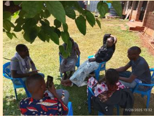
Facilitators wanakula breeze chini ya mti

One of the greatest parts of my testimony is how the Mission helped me grow spiritually. The prayers, the praise and worship, the sharing of gospel songs, and the unity during outdoor activities reminded me that God works through both quiet moments and joyful gatherings. I found a deeper peace, a renewed sense of purpose, and a stronger desire to live out my faith boldly.