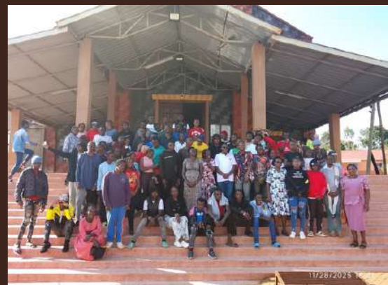
A snippet with the MYM youth, their Chaplain and YES members

YES Family facilitators in the mission and their encouragement kept me going even when I felt weak or overwhelmed. Their positivity reminded me that God always places the right people in our lives at the right time.